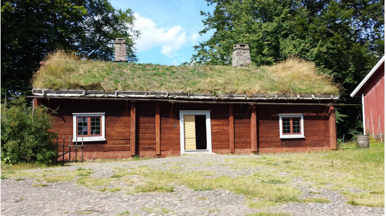
The birthplace of Linneaus, Råshult

In the afternoon we will visit the Krapperup Estate on the west coast of Skåne (Scania), at Mölle, and a private garden near Krapperup Estate. Krapperup dates from medieval times, but the present manor, except the wings, is 16th century. The park offers outstanding flower arrangements, roses and perennials. The park also contains a landscape garden that dramatically utilizes the difference in altitude between the land and the sea.