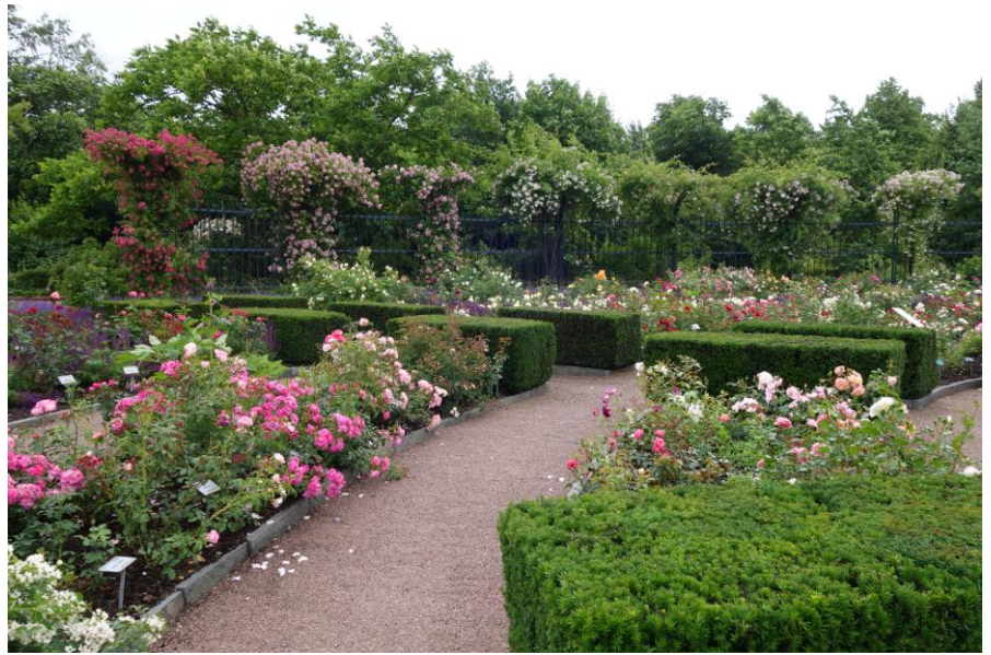
Gothenburg Rosarium

The rose, the queen of flowers, has for a long time held a prominent position at The Garden Society of Gothenburg.