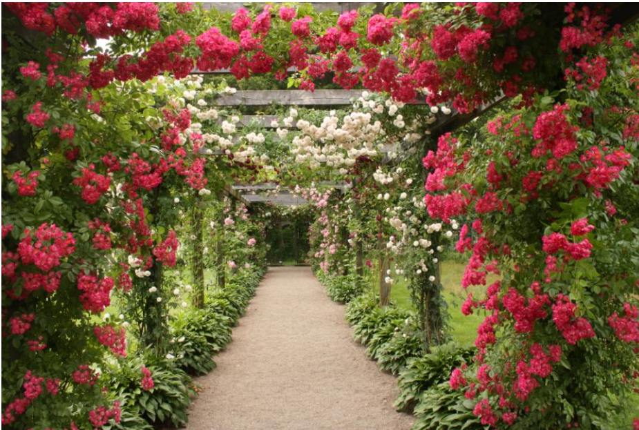
Fredriksdal Rose Garden